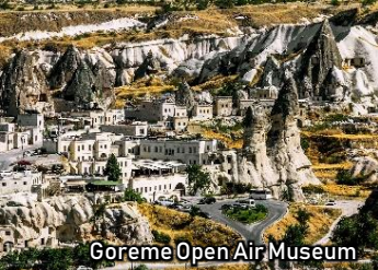
Goreme Open Air Museum