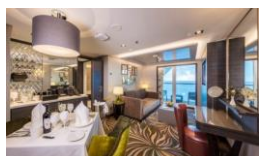
Palace Penthouse 皇宮行政套房