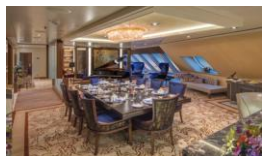
Palace Villa 皇宮庭院別墅