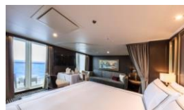
Palace Suite 皇宮套房