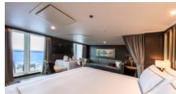
Palace Suite 皇宫套房