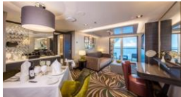
Palace Penthouse 皇宫行政套房