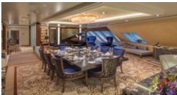
Palace Villa 皇宫庭院别墅