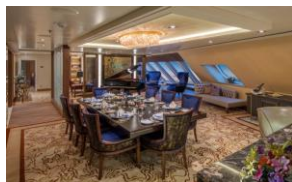
Palace Villa 皇宮庭苑別墅