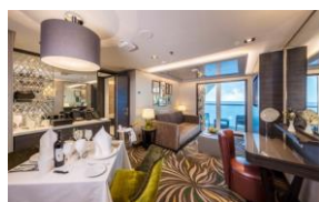
Palace Penthouse 皇宮行政套房