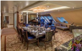
Palace Villa 皇宫庭苑别墅