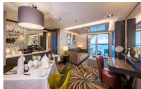
Palace Penthouse 皇宫行政套房