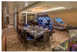
Palace Villa 皇宫庭苑别墅