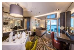
Palace Penthouse 皇宫行政套房