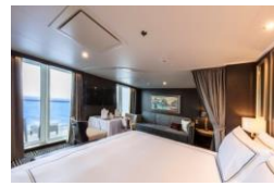
Palace Suite 皇宫套房