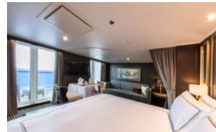
Palace Suite 皇宫套房