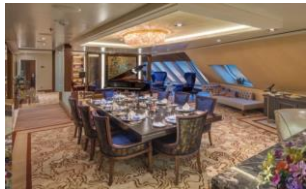
Palace Villa 皇宫庭院别墅

~ Mar 25, 2020 depart at 2200 (Last Boarding 2030)