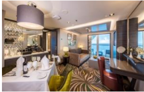
Palace Penthouse 皇宫行政套房