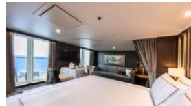
Palace Suite 皇宫套房