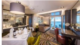
Palace Penthouse 皇宫行政套房