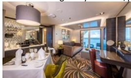
Palace Penthouse 皇宫行政套房