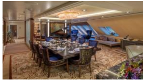
Palace Villa 皇宫庭院别墅

Bintan Island Ferry & Land Transfer Service to Plaza Lagoi Bay - SGD 30/pax