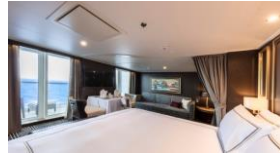
Palace Suite 皇宫套房